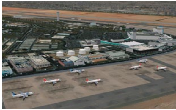
Photo realism delivers highest fidelity for maximum training benefit.