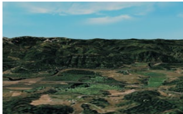
Geocentric databases support worldwide flight with no discontinuity, distortion.