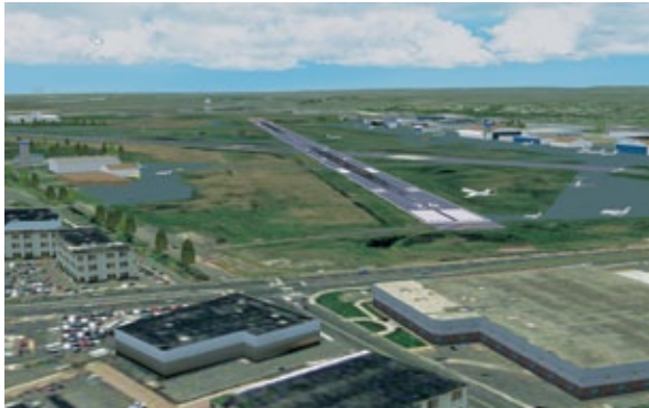
Worldwide database includes specific commercial airports.