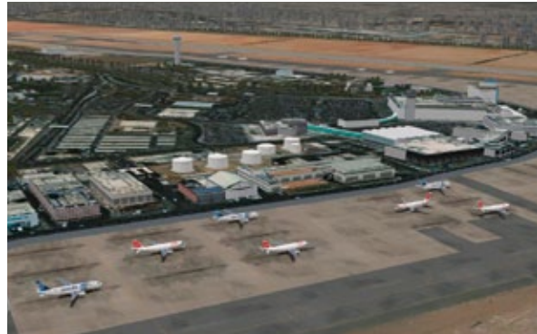
Photo realism delivers highest fidelity for maximum training benefit.