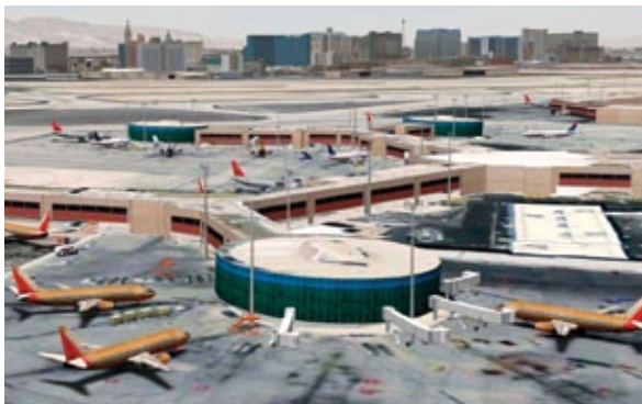
Training simulation visual depicts busy commercial terminal.