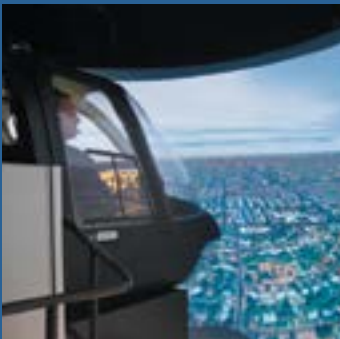
Business aircraft visuals