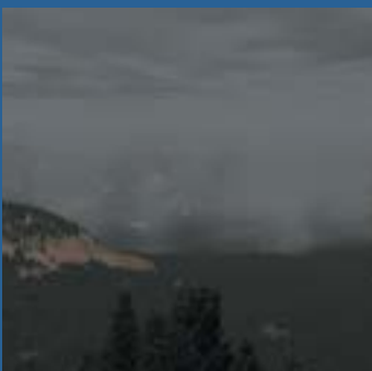
Multi-vis weather simulation