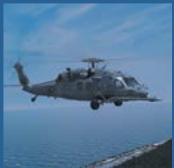
Military mission rehearsal