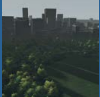
Dynamic shadows, unique shading