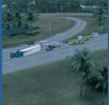
Emergency response scenarios