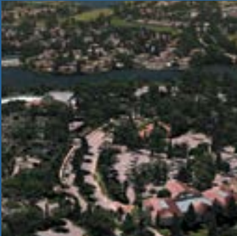
Unprecedented scene detail