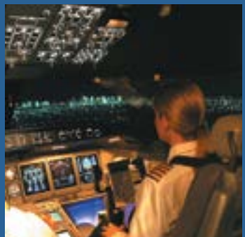
Commercial airliner visuals